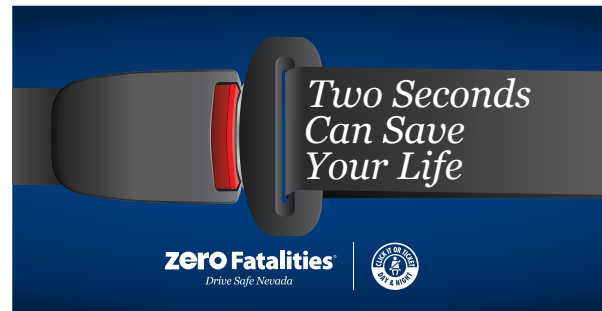
Online animated banners